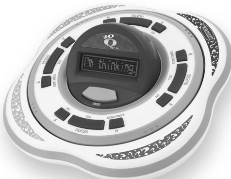
P6624 For up to 4 players / Ages 8 and up INSTRUCTION MANUAL P/N 823D2100 Rev.B

Are you ready for the first multiplayer version of 20Q™? This transformation of the classic handheld game fires up friends and family as you go head-to-head with 20Q™ and the other players. The first player to outwit 20Q™ and the other players wins! Sound easy? Guess again.